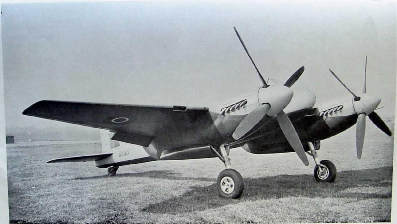
HORNET;—SEA HORNET similar.